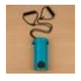
Molded sock aid