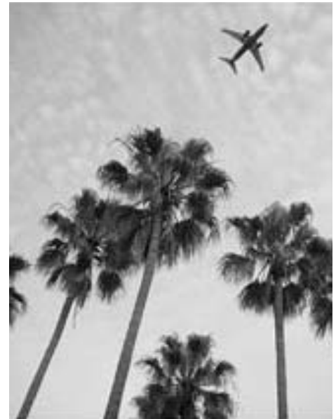
San Diego Airport - easy in-easy out - 20 minutes away