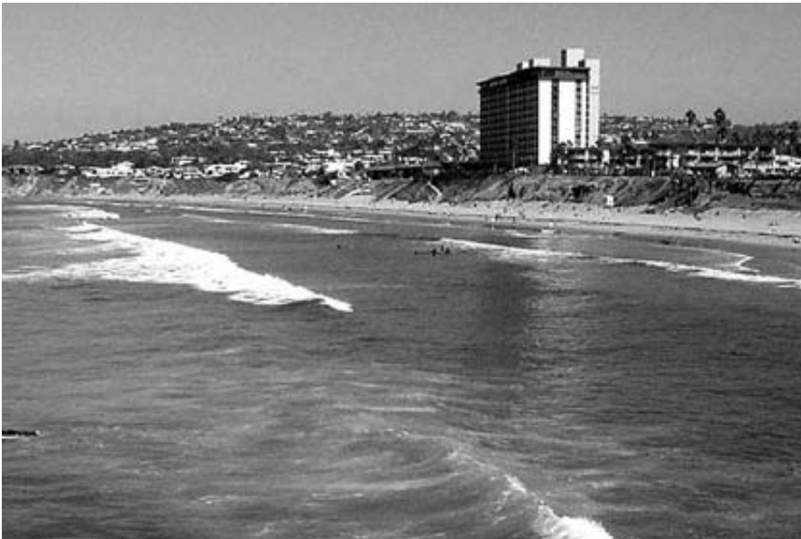
Beaches close by - Pacific Beach, La Jolla, & Sea World are 15-20 minutes away